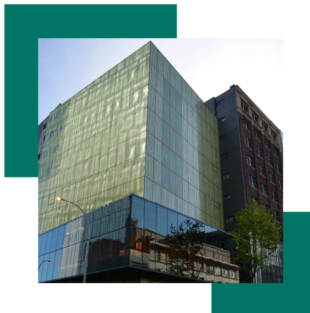
Wilder Building - Dance space, Montreal, QC / Silkscreened insulating glass S1de One / Lapointe Magne & associates and Aedifica in consortium